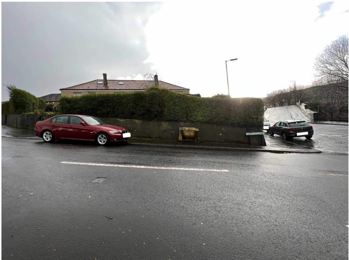
Photo of Proposed Location of DPPP (approx. behind the yellow grit bin)